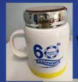
Ceramic Mug with secure lids $850