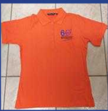
Polo - Shirts Male and Female Sizes: Small, Medium, Large, 1XL, 2XL, 3XL $1,385