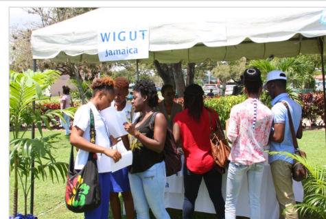
Students at the WIGUT booth during Office of Student Financing Day Expo, March 30, 2017.

The Scholarship and bursaries are administered by the Office of Student Financing, and are awarded based on academic performance (i.e., maintaining a GPA of 3.3), demonstration of financial need, leadership qualities and active involvement in co-curricular activities.